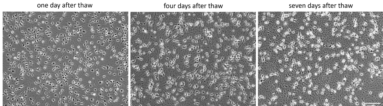
Exemplary brightfield images of iNGN2 neurons after thaw. Scale bar: 200 µm.

Co-cultures with astrocytes are recommended for long-term culture, as iNGN2 neurons may start to detach after 16 days without astrocytic support.