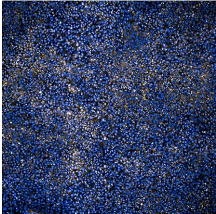
CXCR4 + DAPI