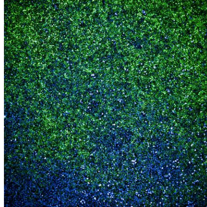
Otx2 + DAPI