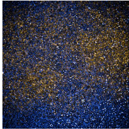
Pax6 + DAPI